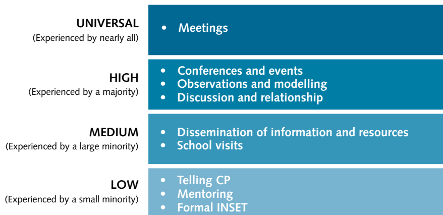
Figure 3.1 A typology of approaches to learning

During the pilot phase of the research an initial typology of approaches was developed. This has been refined following the main phase of data collection. There were nine distinct approaches. They have been ranked according to the proportion of interviewees who have experienced them.